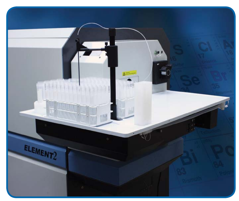
SC-E2 DXS integrated on the Thermo ELEMENT 2 ICPMS with integrated MP<sup>2</sup> micro peristaltic pump