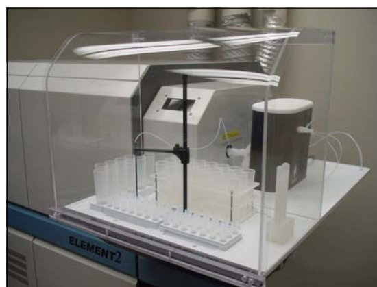
SC-E2 autosampler with clean enclosure attached