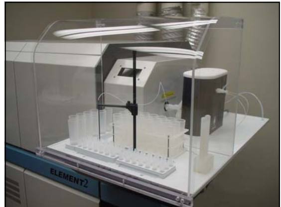
SC-E2 autosampler with clean enclosure attached