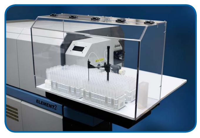
SC-E4 DXS Enclosure on Thermo ELEMENT 2

ULPA filter side plate available upon request for either the right or left side of the SC-E4 DXS enclosure